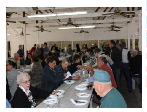
Membership Luncheon, 2013 Members reminisce with each other while lunch is being prepared.

A 50/50 drawing was held which benefits our Scholarship program.